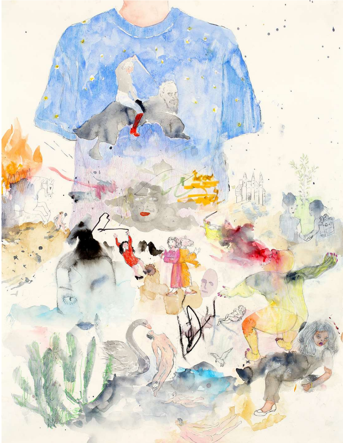
The devine child 3/3, Ink, watercolor, crayon drawing on canson paper , 53 x 68 cm, 2022