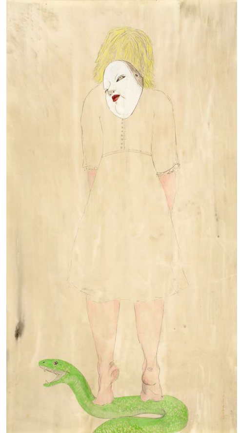
Persona. 1,2,3, drawing on japanese paper, 83 x 45 cm, 2022