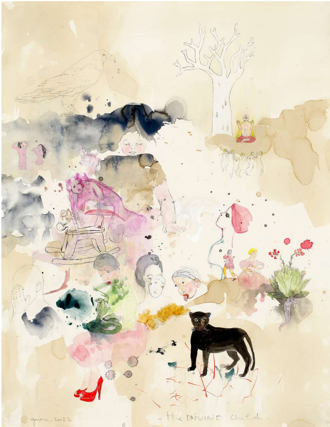
The divine child 2/3, Ink, watercolor, crayon drawing on canson paper , 53 x 68 cm, 2022