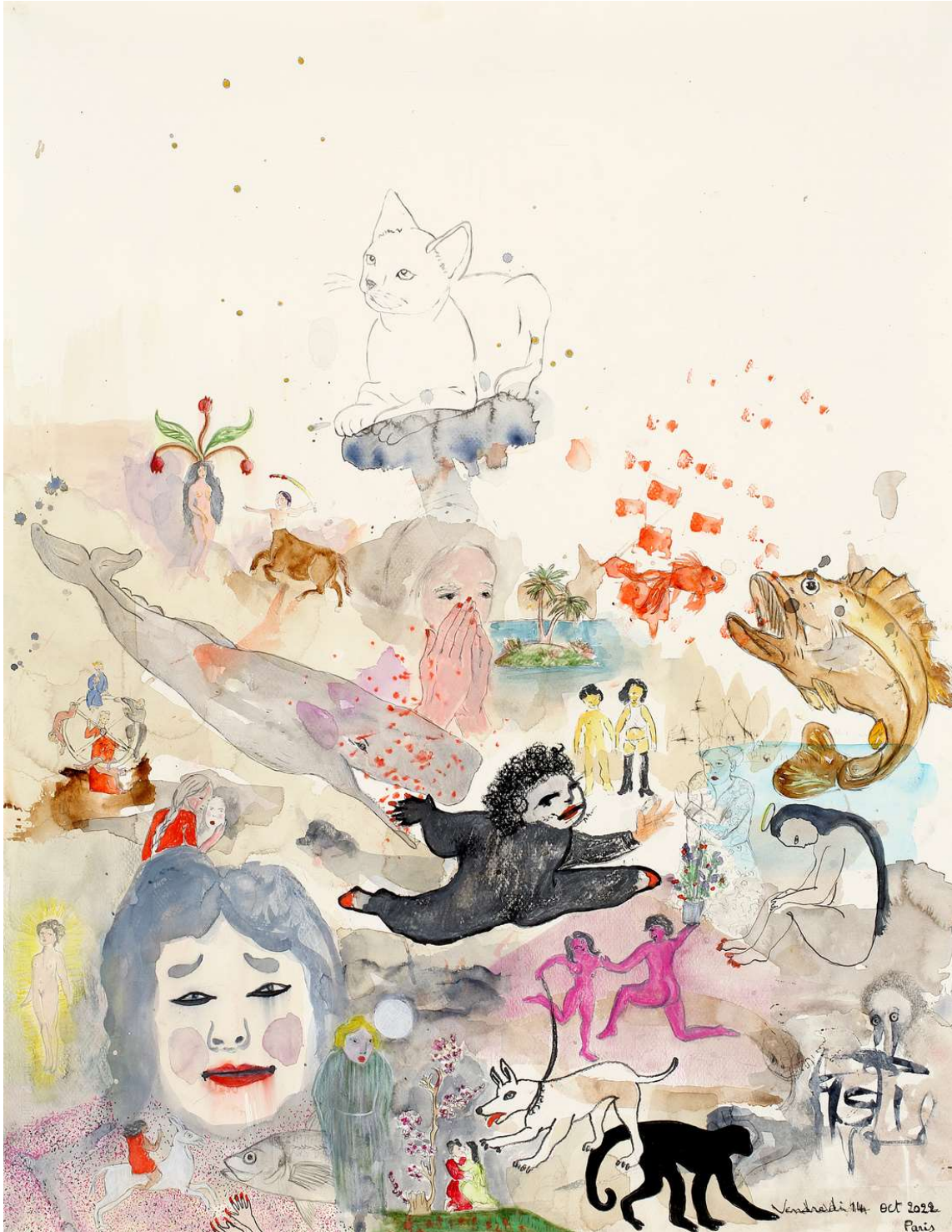
The divine child 1/3, Ink, watercolor, crayon drawing on canson paper , 53 x 68 cm, 2022