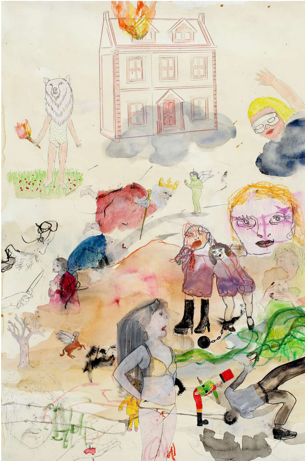
The doll's house burns down, Ink, watercolor, crayon drawing on canson paper 75 x 50 cm, 2023